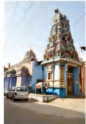
Sri Balaji Temple