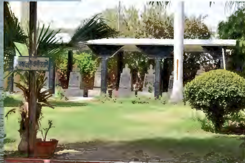
Shahid Smarak Udyan

This temple is situated on a mountain in Ahraura, which is around 60 k.m. away from Mirzapur district headquarters. People from nearby districts come here for darshan. Near temple there is a stone carving of King Ashoka which is preserved by Archeological Survey of India.