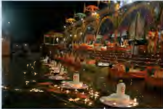
Dev Deepawali, Varanasi

Vindhyachal is an important site of attraction due to nearness to Varanasi (70 k.m.). Tourists enjoy the viewing of long ranges of ghats situated at the bank of Ganga River, and the temples of Kashi Vishwanath, Kalbhairav, Sankatmochan, Maa Durga- Annapurna and centres of learning like Kashi Hindu Vishwavidyalaya, Kashi Vidyapith. Ganga Mahotsav- Dev Deepawali, Shivratri, Ram Lila of Ramnagar, Nakkataiya, Bharat Milap, Nag Nathaiya festivals et cetera are special attraction of this place.