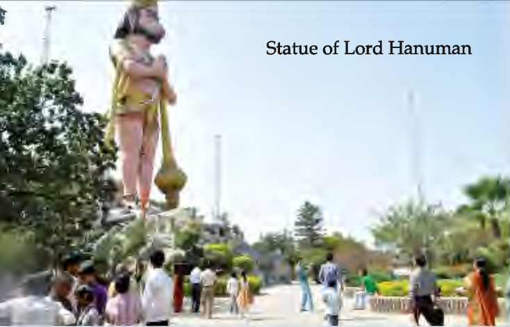
Statue of Lord Hanuman