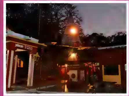
Maa Ashtabhuja Temple

Maa Ashtabhuja Devi Temple is situated at exquisitely charming vindhya-mountain and at a distance of just three Kilometer far from Maa Vindhyawasini Devi Temple . This place is associated with the tenet of myth . According to this when Kans was going to kill the newly born daughter of Yashoda by knocking down at the ground realizing it to be the eighth issue of Devaki ( on previous occasion kans had heard a destined voice of heaven that eighth issue of Devaki would kill him ) the girl slipped from his hand and made her way to celestial sphere and at a later stage appeared in the form of Shakti (the goddess of power) at vindhya -mountain. The temple is situated at a height. First one has to travel by a vehicle then by using stair one can go there easily. One can enjoy the charming bird's view of Vindhyachal city from the temple. In and around Maa Ashtabhuja temple and adjoining temple premises there are a lot of temples and other sight-seeing places.