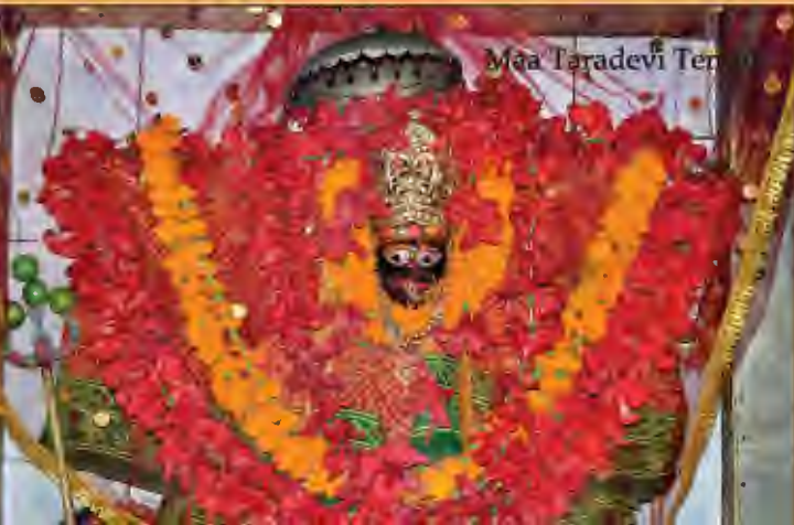
Maa Taradevi Temple