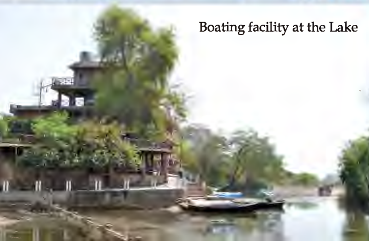
Boating facility at the Lake