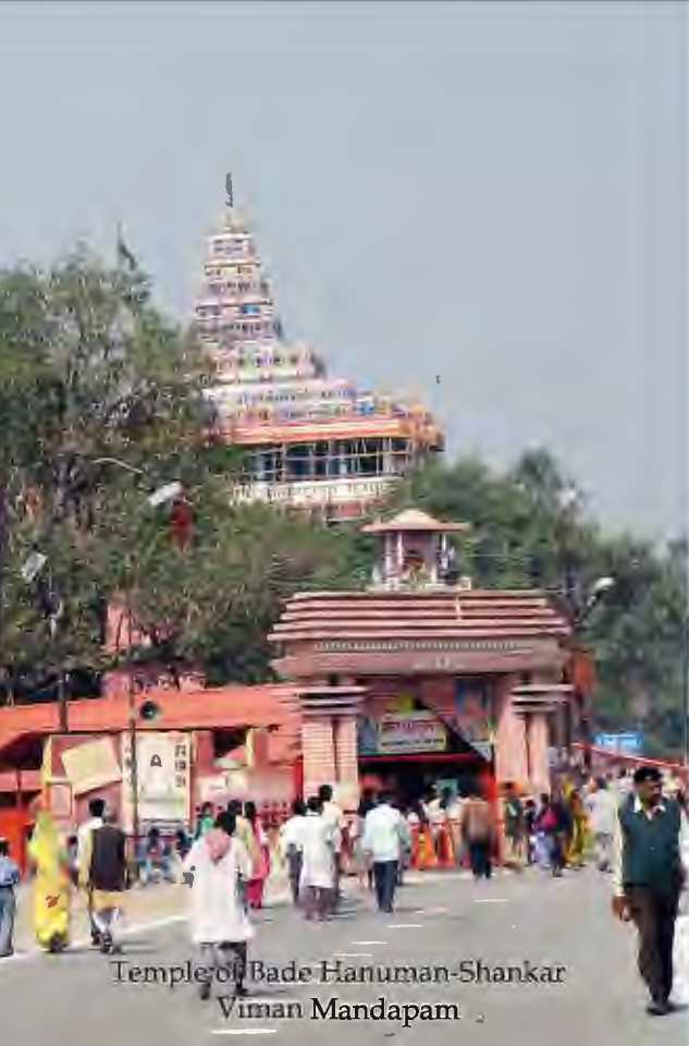
Temple of Bade Hanuman-Shankar Viman Mandapam