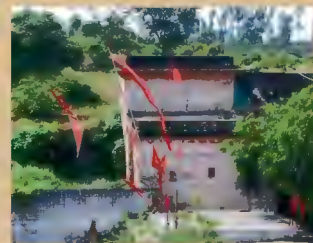
Old Temple of Goddess Durga