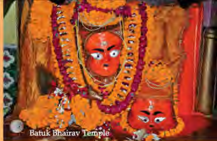
Batuk Bhairav Temple

According to a legend, tarkeswarnath temple situated near kachahari (court), Mother Laxmi had gone into penance at this very place by hearing the greatness of Tarkeswarnath from Lord Vishnu. Even after prolonged penance Lord Shiva did not appear. Then Mahamaya dug a tank towards north of tarkeswar. This tank was later renowned as Laxmi-kund.