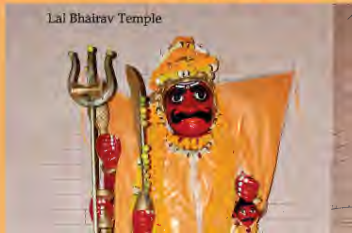
Lal Bhairav Temple