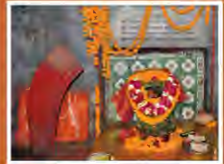
Maha Kali Temple

Vindhya-region is also famous for singing kajli(a typical folk song), whose emergence is associated with Maa Kajla Devi. Kajla devi is the second name of Maa Vindhyawasini Devi. By having a glimpse through smallish window of Maa Vindhyawasini temple the tradition of affixing Kajli-tika (a mark put on the forehead) is still in vogue. In every year famous kajli-singers assemble at the temple of Maa Vindhyswasini temple at Akadashi (eleventh day of either half of a lunar month) of Krishna paksh(dark half of a lunar month) in Jyestha mas( third month of a Hindu calendar) and begin their worship through kajli-singing which continue up to the end of the rainy season.