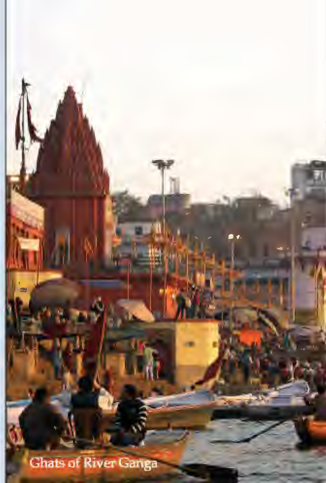
Ghats of River Ganga