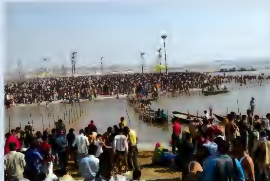
Magh Mela, Allahabad

Allahabad is situated at a distance of 125 k.m. from Vindhyachal town. This place is famous around the world for holding Kumbh fair. Here, the devotees can see Sangam (confluence of Ganga, Yamuna and Saraswati river), Bade Hanumanji, Shankar Viman Mandapam, Bhardwaj Aashram, Anand Bhawan, Khusrobagh, University, museum and other places of attraction. Organising of Annual Magh fair, Dashehra-Ramdal are worth-seeing functions.