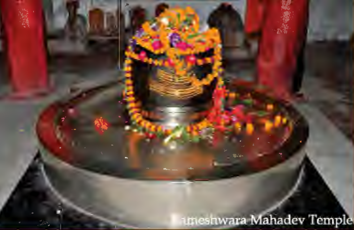
Rameshwara Mahadev Temple