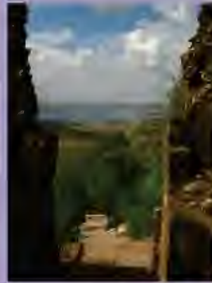
Fort of Vijaygarh

(Shivalay of Gothani, Kudavidevi, Agori fort), Ghorawal (statue of lord Vishnu), Shaktinagar (N.T.P.C- Singrauli, Jwaladevi), Renukut (Hindalco, Lotus temple, Renukeshwar Mahadev, Shri Ram Mandir, Radha- Krishan Mandir), Pipri (Rihand dam, natural scene of Govind Ballabh Pant Sagar), Obra (Electrical project) et cetera.