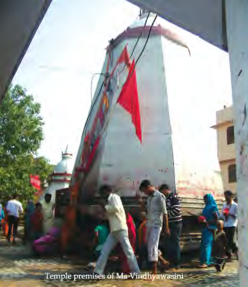
Temple premises of Ma Vindhyawasini