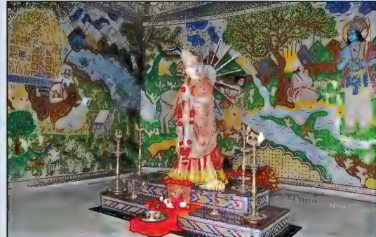
Statue of Goddess Sita

This is a charming place situated at a distance of about 45 k.m. from Vindhyachal (via-Gopiganj-Jangiganj). In the main temple dedicated to mother Sita, a grand statue of Sita ji has been installed and the story of her merging into the land has been depicted in an attractive manner. In addition the gigantic statue of Pawansut (son of Lord of air) Lord of Hanuman, Valmiki temple, Shiv temple situated in caves have been attractively constructed. Lake with the facility of boating and guest house are some of the attractions of this place.