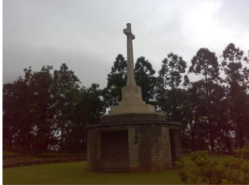
Kohima, Nagaland, India