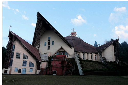
Cathedral Road, Kohima, Nagaland, India

The red-roofed Catholic Church on Aradurah Hill is the most prominent landmark in Kohima. An interesting, geometrical building, it's supposed to be the largest cathedral in the