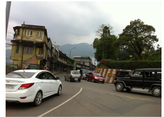
Upper Bayavü Hill, Kohima, Nagaland 797121

Kohima Museum exhibits the rare collection of articles of different tribes that depicts the history and tradition of Nagas. It is an invaluable treasure trove where one can get a glimpse into Naga culture through history. Here one can find panorama of each tribe being displayed. The Naga architecture, social hierarchy and custom, costume and culture are all displayed in this State Government Museum. The main items