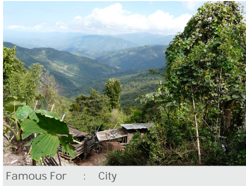
Famous For : City

“ Kohima, the capital of Nagaland is situated in the Northeastern region of India. Valleys plush with natural beauty and raw ethnic cultures, makes Kohima an ideal place to visit.