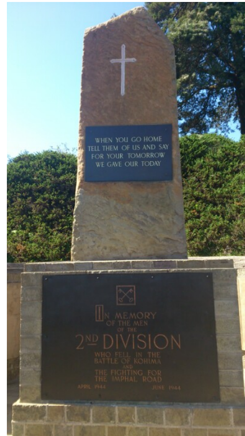
NH 39, Kohima, Nagaland, India

War Cemetery is maintained by the Commonwealth War Graves Commission, which takes care of 2,500 cemeteries all over the world to commemorate those who died in the two world wars. Sir Edwin Lutyens, who designed New Delhi, was one of the principal architects involved in establishing its design.