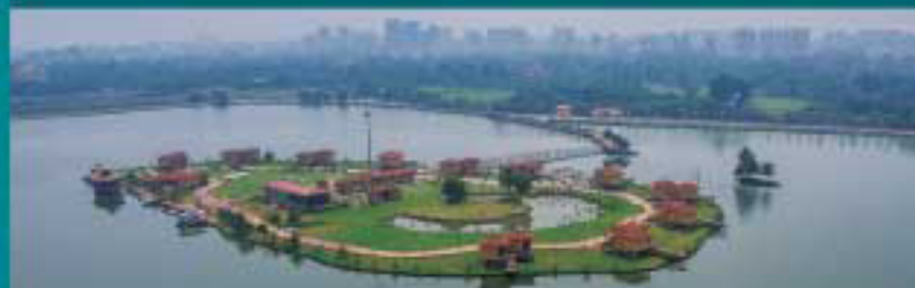
Ekante Cottages, Eco Park

The Gallery was established in 1962 and has a collection of rare artifacts, early stone tools, and antiques from many Palaeolithic, Mesolithic and Neolithic sites. Come and learn all about our evolution from early man to the modern day man.