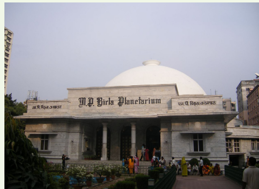
MP Birla Planetarium

Victoria Memorial Hall & Museum (Map Grid B3)