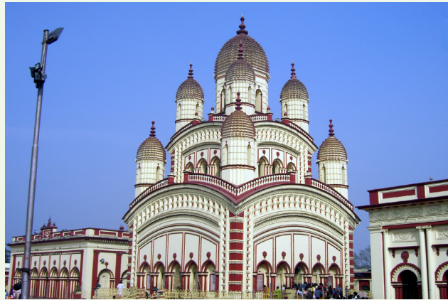
Dakshineswar Kali Temple

The Dakshineswar Kali Temple on the eastern riverbank of Hooghly dates back to 1847-1855. The shrine was constructed by Rani Rashmoni, on the site that was once a penance ground for Ramakrishna Paramahansa. Just 3 km from here, one can visit the famous Belur Math, the monastery of Shri Ramakrishna Paramahansa. A boat ride to this temple is not to be missed.