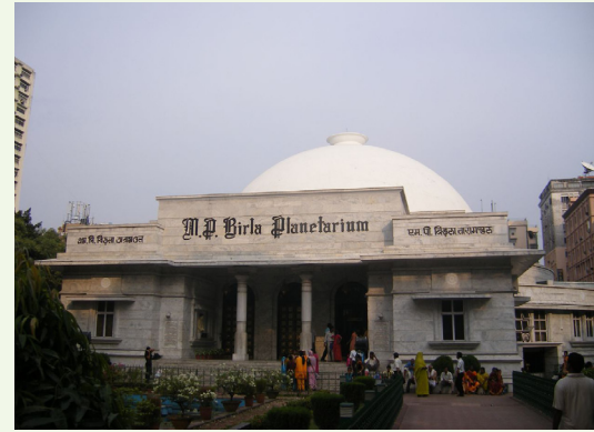
MP Birla Planetarium

Victoria Memorial Hall & Museum (Map Grid B3)