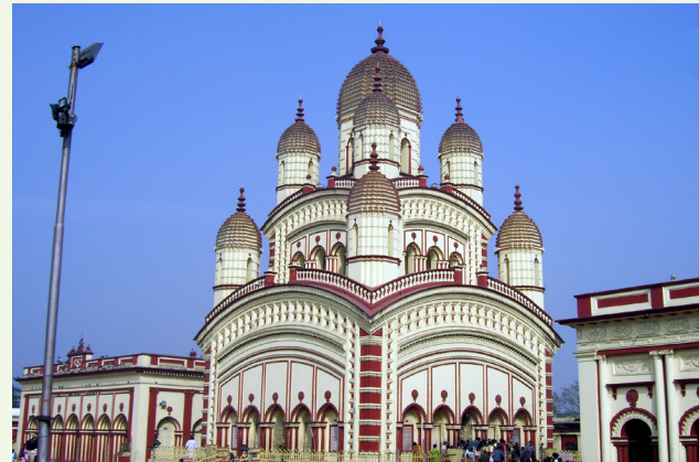
Dakshineswar Kali Temple

The Dakshineswar Kali Temple on the eastern riverbank of Hooghly dates back to 1847-1855. The shrine was constructed by Rani Rashmoni, on the site that was once a penance ground for Ramakrishna Paramhansa. Just 3 km from here, one can visit the famous Belur Math, the monastery of Shri Ramakrishna Paramhansa. A boat ride to this temple is not to be missed.