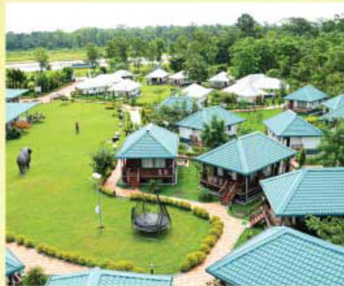
Murli Tourist Lodge