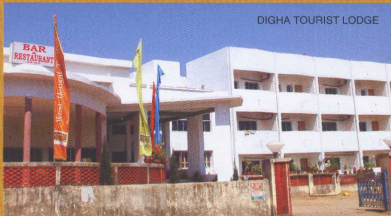
DIGHA TOURIST LODGE

Local Transport : Un-metered taxis, auto-rickshaws and rickshaws are easily available for local transport.