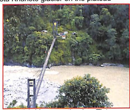
A bridge over the river Tista