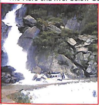
A jeep wades through the Meyong chu waterfall