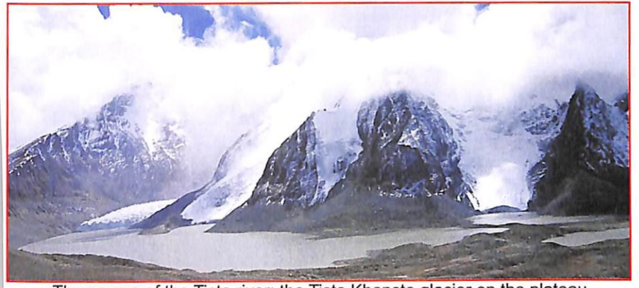
The source of the Tista river: the Tista Khanste glacier on the plateau