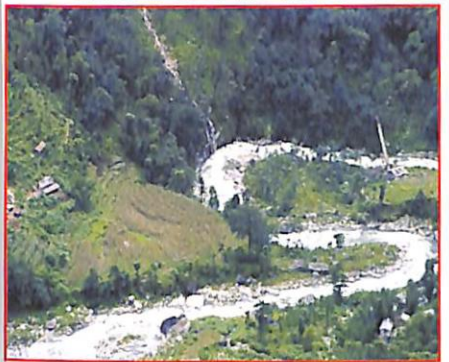
The Roro chu river below Gangtok