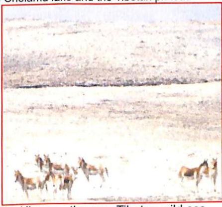
Kiangs - the rare Tibetan wild ass