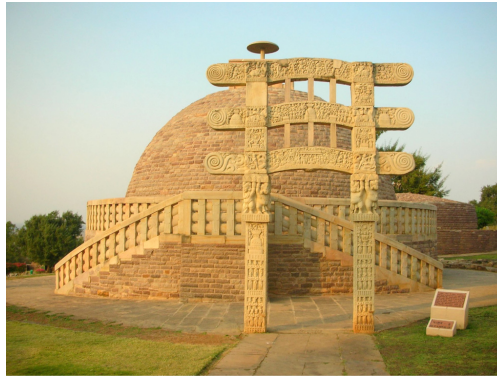
Famous For : State / Provinc